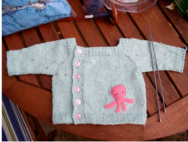
0 - 3 M size shown